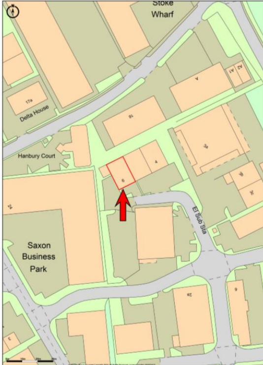
Promap V2 Ordnance Survey Licence number: 10002423 Printal Scale: 1:11250 Paper Size: A4

Misrepresentation Act: The accuracy of any description, dimensions, references to condition, permissions for use and occupation and other details contained herein are not guaranteed and are for guidance only and as such prospective purchasers or tenants must not rely on them as statements of fact or representations and must satisfy themselves of their accuracy. Neither John Truslove nor any of their or representatives has any authority to make or give any representation, warranty or enter into any contract whatsoever in relation to the property. Prices and rents quoted in these particulars may be subject to VAT in addition. The reference to any mechanical or electrical equipment or other facilities at the property shall not constitute a representation (unless otherwise stated) as to its state or condition or that it is capable of fulfilling its intended function.